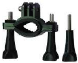
Handle Bar/Pole Mount